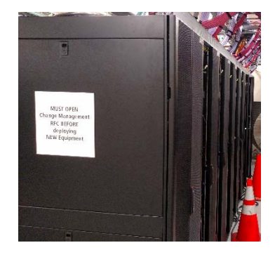
Figure 1. IT Change Management signage

The ICT IT Change Management process manages approximately 1,700 changes annually.